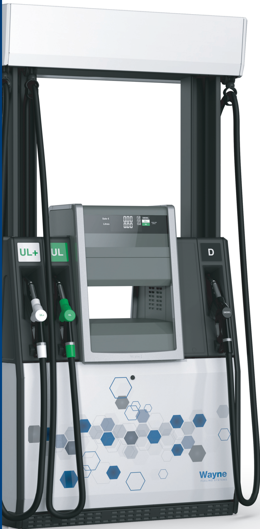
Wayne Helix™ 5000 II fuel dispenser

Less service interventions mean that this dispenser is able to effectively deliver a low TCO, whilst continuing to bring you reliable performance and stability. Certified meter accuracy and exceptional meter stability for minimal drift will bring incomparable performance and return on investment for your fuel business.