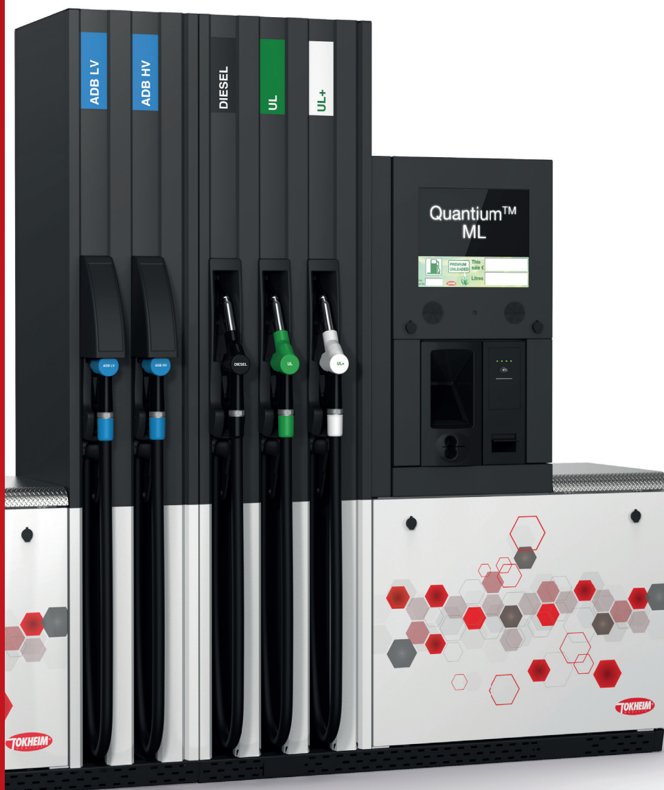
Tokheim Quantum™ ML AdBlue® dispenser

The highly configurable Quantum ML AdBlue® dispenser is here to meet the fueling demands of today and tomorrow. Thanks to our trusted Tokheim quality delivering reliable operation, this dispenser delivery lower total cost of ownership (TCO), has greater uptime than other pumps on the market, thanks to a reduced need for maintenance intervention.