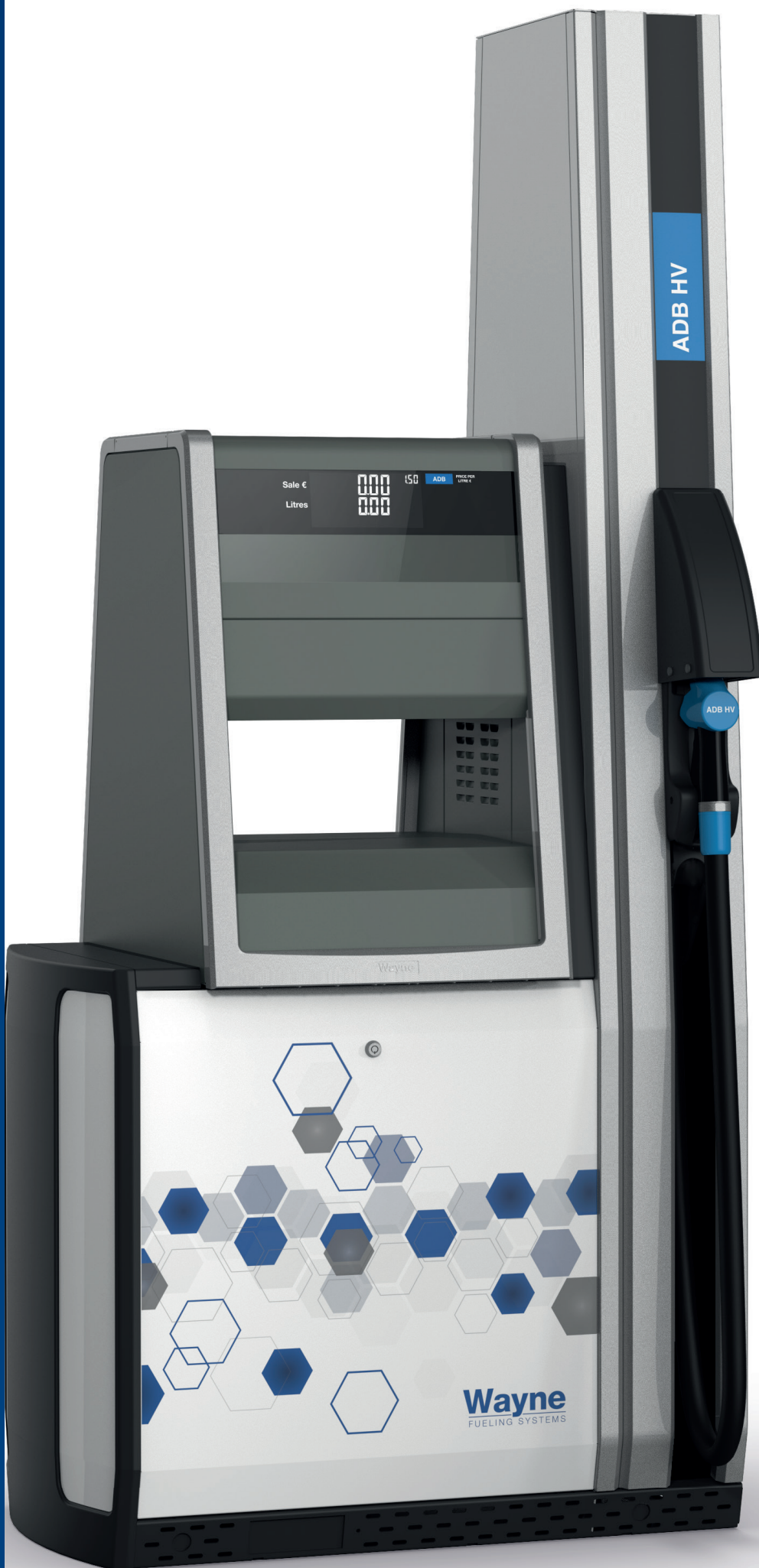
Wayne Helix™ 6000 II AdBlue® dispenser

Featuring the best-of-the-best DFS dispenser technology, the Helix 6000 II AdBlue® dispenser is designed with high-quality materials to effectively handle the highly corrosive nature of the AdBlue® fluid. With special treatments to our hydraulic and metering systems, this model delivers highly accurate metering and reliable performance for low total cost of ownership (TCO). A more reliable dispenser equals less service interventions and downtime. When there's no downtime, there's no loss of sales or service costs.