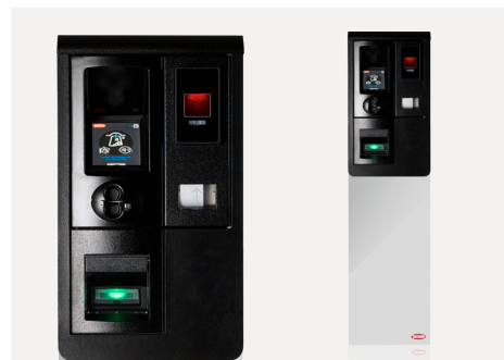
Crypto VGA™ BNA (Bank Note Acceptor)

A compact, standalone outdoor payment terminal, combining sleek looks and a smart design. It can connect and control payment for multiple dispensers (including third party dispensers) on one site.