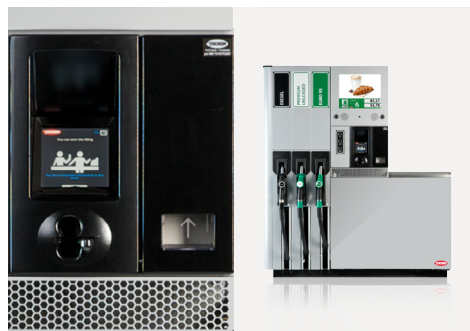
Crypto VGA™ DIT (Dispenser Integrated terminal)

A single or double-sided solution that fits neatly across the range of Quantum dispensers offering a payment option, as well as tailored retrofit solutions for Tokheim legacy and other third party dispensers. The Crypto DIT payment terminal is always securely installed within a specially designed anti-fraud protection housing unit.