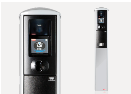
Crypto VGA™ Slimtouch

A single or double-sided solution that fits neatly across the range of Quantum dispensers offering a payment option, as well as tailored retrofit solutions for Tokheim legacy and other third party dispensers. The Crypto DIT payment terminal is always securely installed within a specially designed anti-fraud protection housing unit.