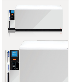
Tokheim AdBlue® Maxi-bulk™ Storage Tank

We offer a range of smaller 'mini bulk' storage tanks that are delivered with dispenser-integrated options.