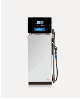
Quantum™ 110 AdBlue®

Entry level, one- nozzle design that is suited to basic truck stop layouts. A cost-effective solution that is both reliable and robust.