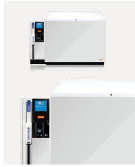
Tokheim AdBlue® Mini-bulk™ Storage Tank

AdBlue® dispenser combined with a multi-product dispenser (up to 10 nozzles), with payment and media options available.