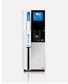
Quantum™ 510 AdBlue®

Entry level, one- nozzle design that is suited to basic truck stop layouts. A cost-effective solution that is both reliable and robust.