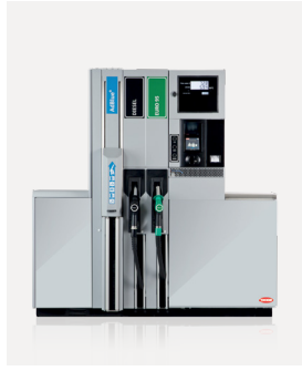
Quantum™ 510 AdBlue® Combo

A sleek stand-alone dispenser with payment options. Sliding door technology for a cleaner and better fuel retailing experience.